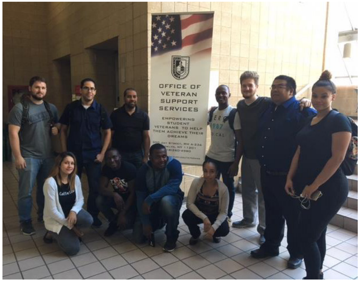
CTVETS club students at City Tech

For a full list of City Tech clubs, please visit our website.