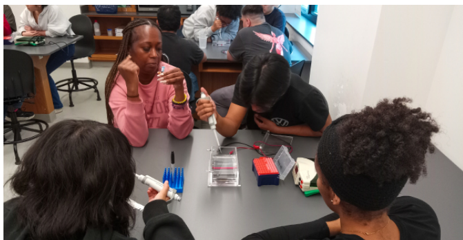
DNA Fingerprinting September 25, 2025