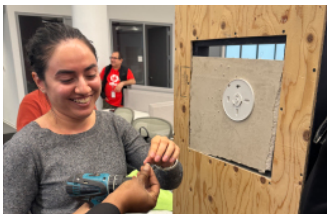
Volunteer learning to install a smoke detector