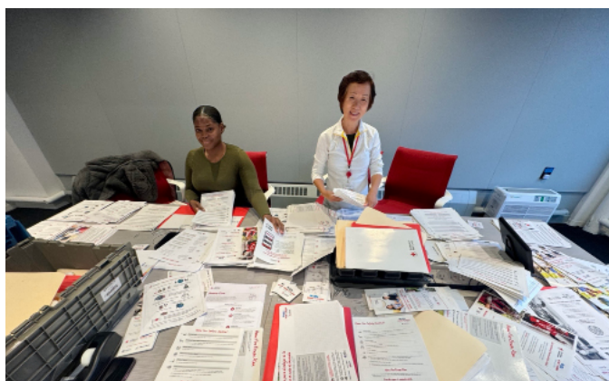
Volunteer in the office