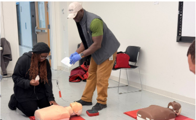
Hands Only CPR, American Red Cross October 30, 2025