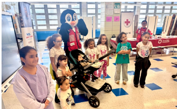
Pedro the Penguin