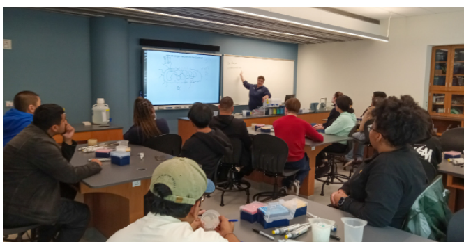
Glowing Genes October 16, 2025