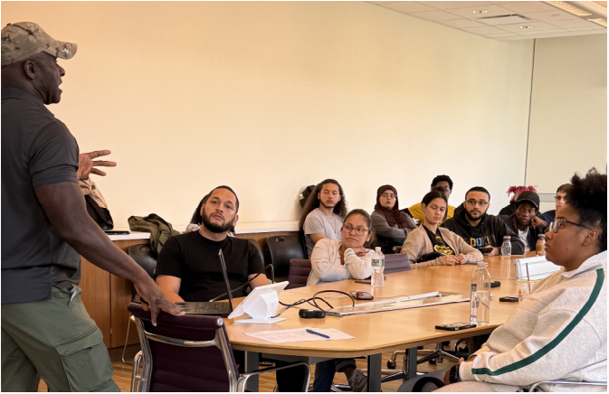
Disaster Preparedness, American Red Cross September 11, 2025