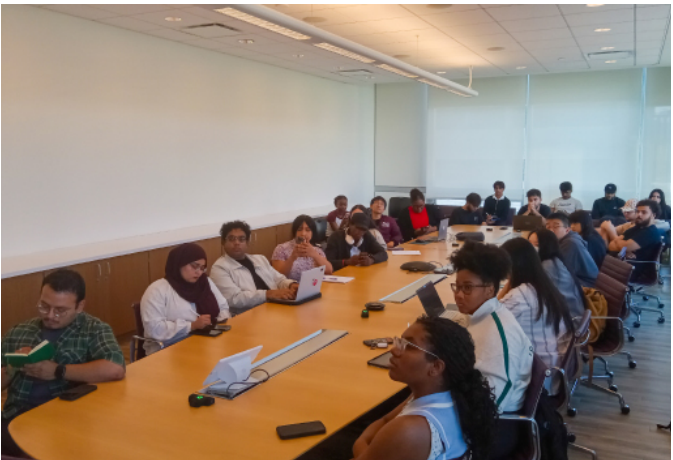
Quick Tip, Big Impacts: Mastering the M.Eng. Application Essays, Cornell University September 18, 2025