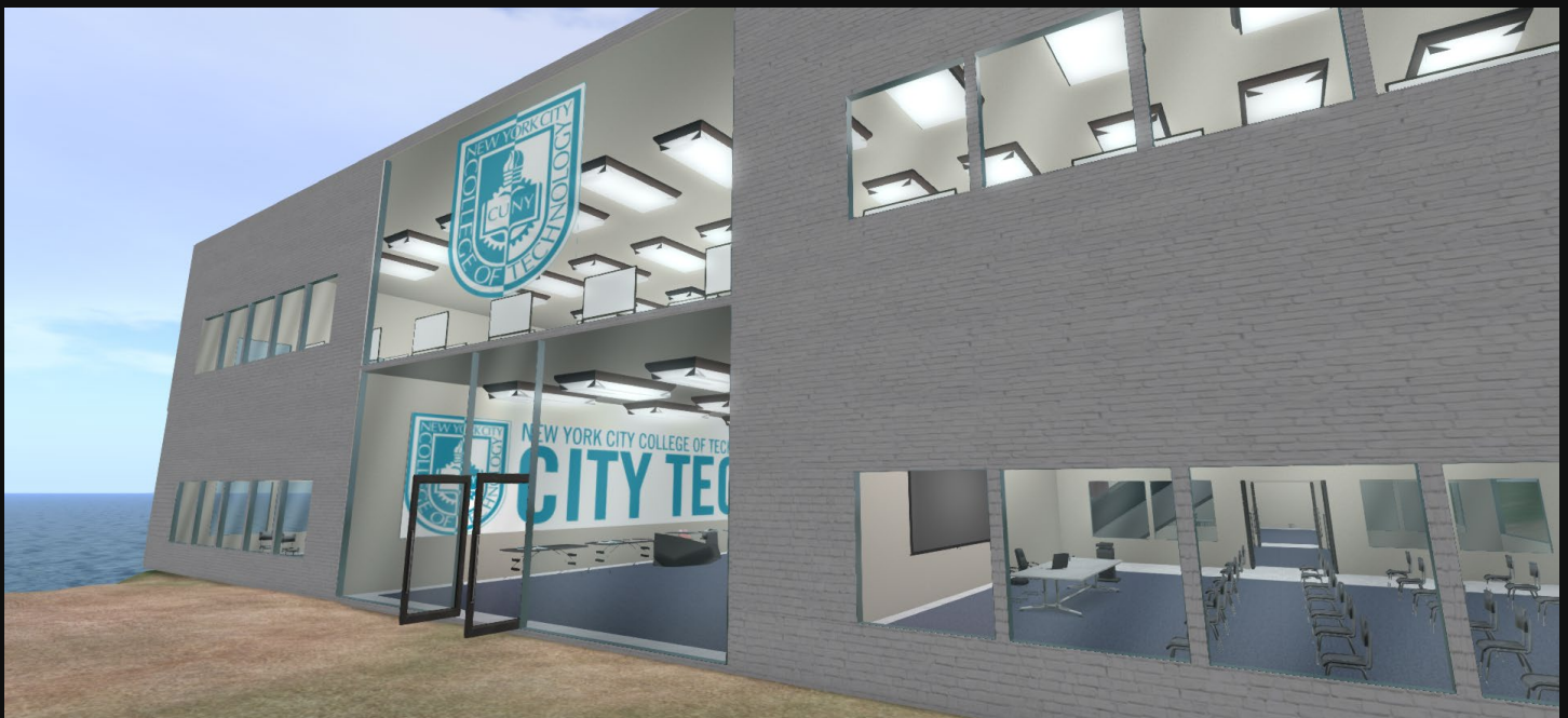
Honors Scholars Program conference building on City Tech island in Second Life.