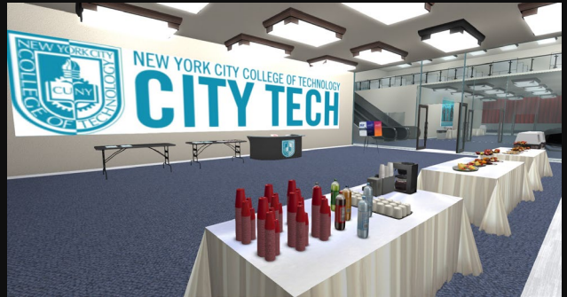
Conference registration area.