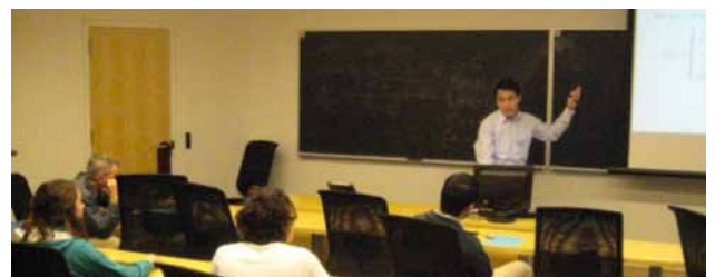
Mid-Hudson Mathematics Conference - Bard College - Think Le October 16, 2011