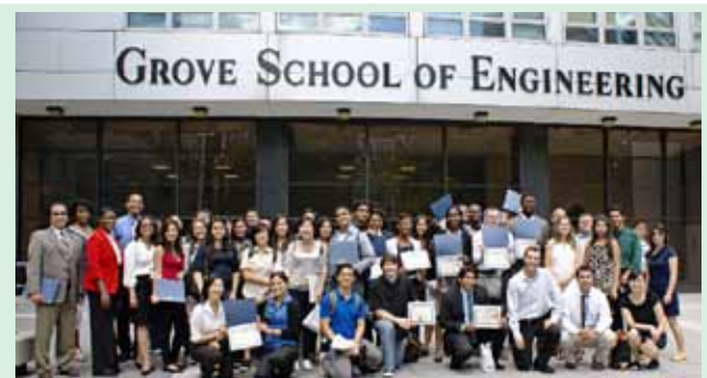
NSF Research Experiences for Undergraduates in Satellite and Ground-based Remote Sensing - August 11, 2011