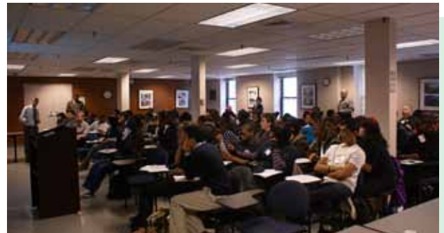
NASA GISS Columbia University with Urban Assembly Institute of Math and Science for Young Women, City Poly High School, and Middle School 394 - November 21, 2011

Steve Jobs has been dubbed " the Inventor of the Future ." His creative style and business technology savvy allowed him to invent devices that touched the lives and sparked the imagination of people all around the world. Steve Jobs had a profound effect on technology information and the way people think about communicating. Similarly, many lawyers, judges, legal scholars, writers, and inventors have also left a lasting impression on the world with their unique accomplishments. In thinking about what these individuals have done to allow people from all parts of the world to think, imagine, and live their lives differently, the Legal Technology students drafted memoranda exploring the contributions that Jobs as well as others from the legal or technology areas have made to our society.