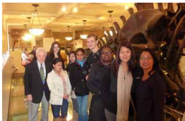
American Museum of Natural History November 4, 2011