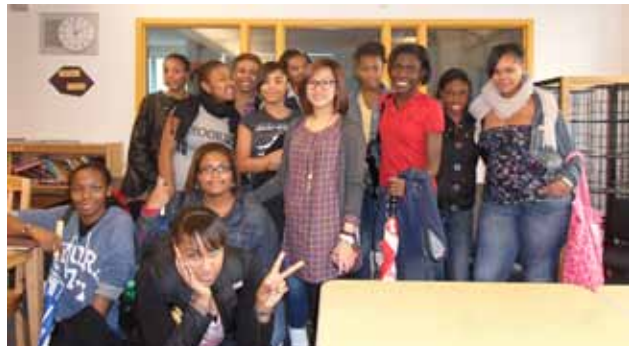
City Tech Women in STEM with Urban Assembly Institute of Math and Science for Young Women

Students investigated and prepared reports on famous trials in U.S. history. They looked into the facts of the case, the attorneys who represented the parties, interesting events that happened during the trial and the outcome of the case. They also explored their own thoughts about the verdict and whether the case would have been decided the same way today.