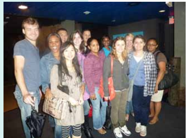
The New York Aquarium September 23, 2011