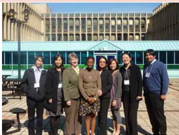
CUNY Supplemental Instruction Conference - Lehman College October 7, 2011