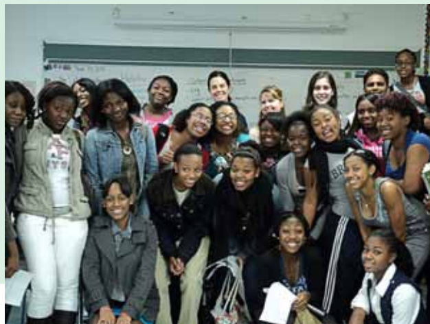
City Tech Women in STEM with Urban Assembly Institute of Math and Science for Young Women