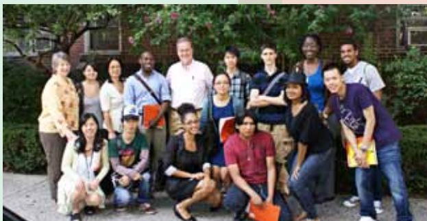
Peer Assisted Learning Peer Leaders