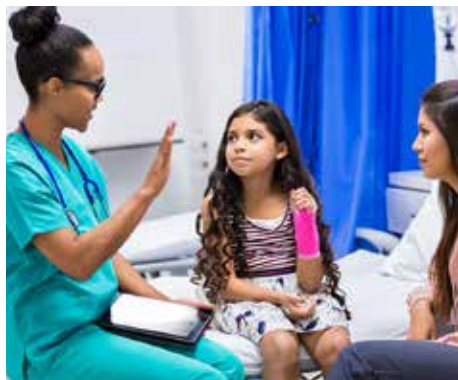
Conversation is the key

The ability to speak Spanish is a tremendous asset in the health care field. This course is designed to help you conduct functional conversations in Spanish for patient translation and conversations with family members. Emphasis will be placed on speaking and listening.