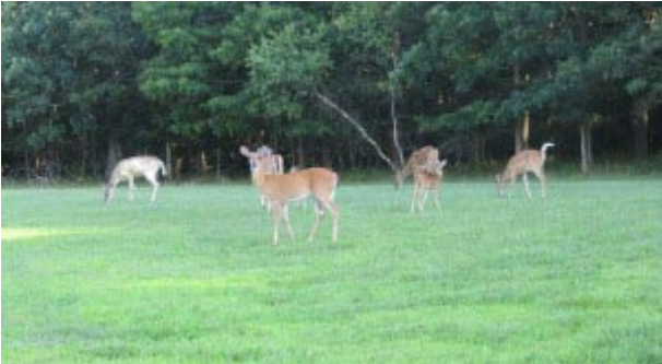
It was fun observing the wild life while at BNL