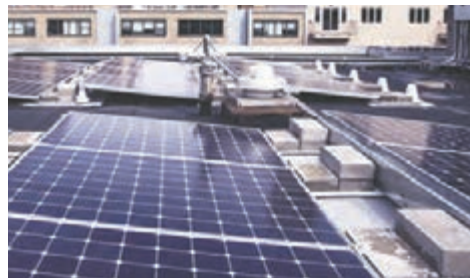
Marcus Garvey Village, Solar + Storage Installed by: Demand Energy

The NABCEP Photovoltaic Associate™ Exam is available to students who have successfully completed the NABCEP Photovoltaic Associate class at City Tech. Students may take the exam by paper and pencil at City Tech on May 25 or at one of several computer-based testing centers in NYC at a date of the student's choosing.