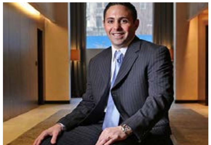
New York Times, February 25, 2011, The Super Comes out of the Basement