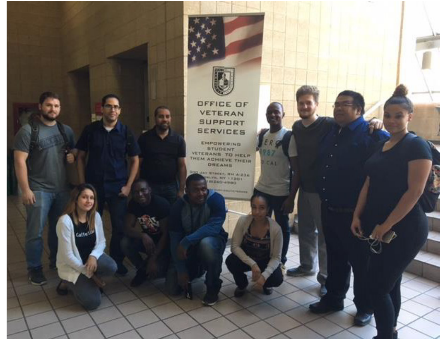
CTVETS club students at City Tech

For a full list of City Tech clubs, please visit our website .